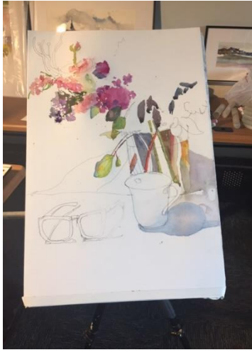
1Demo in progress