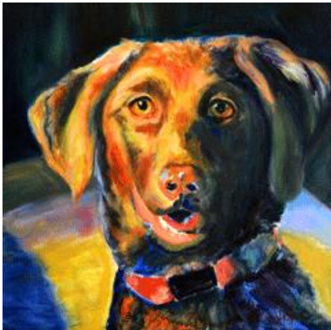
"Fifty Pounds of Love" 18x18 oil