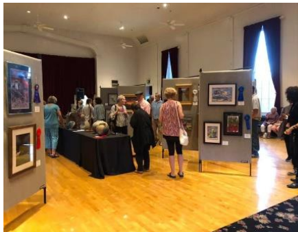
2019 SHOW AT THE OPERA HALL, SONORA

throughout the year as we prepare for the event as well as during the show itself.