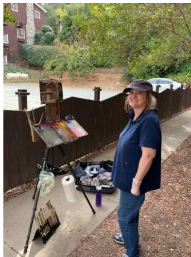
PLEIN AIR PAINTERS ARE FEATURED OUTSIDE THE SHOW

Contact Linda Happel at 209-532-7240 or lindaleehappel@gmail.com for more information on volunteer opportunities!